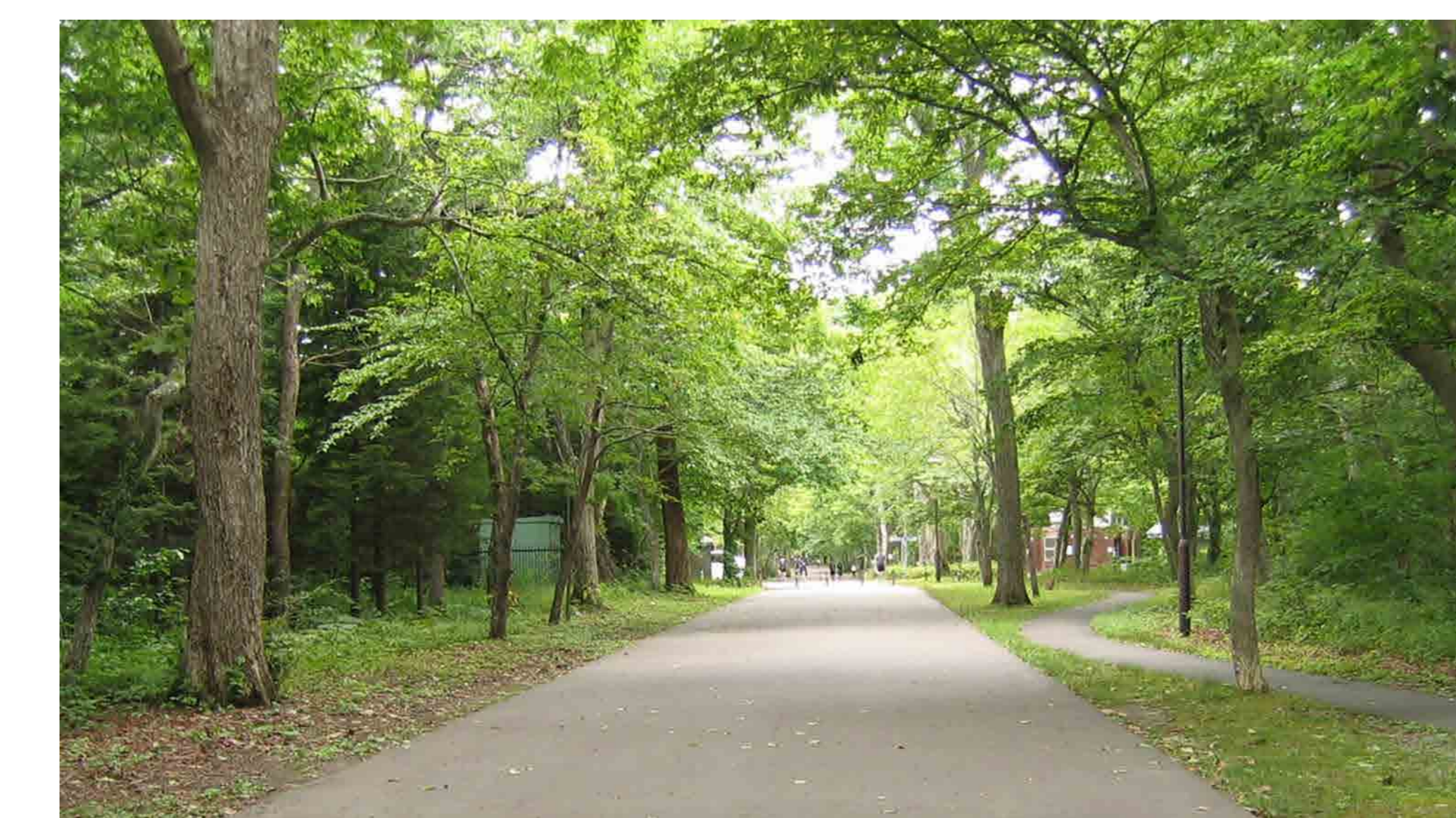
主园路 Main Mall

The whole family can have lots of fun with facilities including “Nakayoshi Hiroba (Square)” playground for small children, “Picnic Hiroba (Square)” space where camping is allowed, and “Chuo Hiroba (Square)” waterscape area with clear fountain water to play in, not to mention the well-equipped sports facilities such as a track & field stadium and a baseball ground.